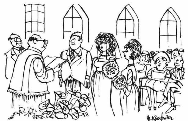
"...THROUGH SICKNESS AND HEALTH, FOR BETTER OR WORSE, THROUGH BASEBALL SEASON, FOOTBALL SEASON, GOLF SEASON..."

Faith is also the conviction that the Son of God has the power to heal bodily sickness. We do right when in illness we come to Him in prayer, leaving it to His wisdom and love to do with us what is best.