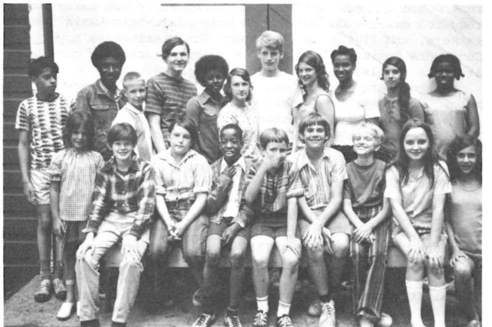
Happy Campers From the Deaf Youth Camp Sponsored By the Metro, N. Y. Lutheran Mission to the Deaf.

Elmhurst, N. Y.-July 8-15 was Deaf Youth Camp Week at Camp of Pines for 17 deaf and 5 hearing young people from Metro N. Y. Lutheran Mission for the Deaf. With almost perfect weather, these young people enjoyed swimming, canoeing, volleyball, softball, handicrafts, nature crafts, and bible study in the beautiful surroundings of Schroon Lake in up-state New York. Thanks to the generous support from the Albany-Schnectady LLL, local groups and individuals some of these campers were granted scholarships which made it possible for them to attend.