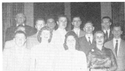
Christ Church Sunday School Staff Jacksonville, Ill.