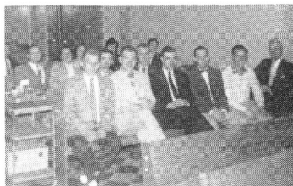
The Columbus, Ind., Group

Columbus, Ind. — Shown in picture is our fast-growing group of this area. We are especially proud of the group of young men who are very faithful in their church at-