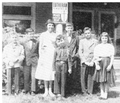
Lutheran Class of Children of Indiana School for Deaf

Shown in an accompanying picture is the group of children who meet at the church every Saturday morning from 9:00 till 11:30. They