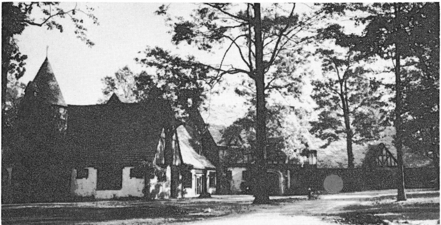
The "farm group" has been converted into modern classrooms

where the 75 children with the teachers eat the noonday meal, the kitchen facilities and apartments for the employees, all substantially constructed and artistically conceived, impress the visitor. Nothing was spared in the construction and erection of all the buildings, and beauty was never sacrificed to ordinary utility, and thoughtfulness and ingenuity are evident everywhere.