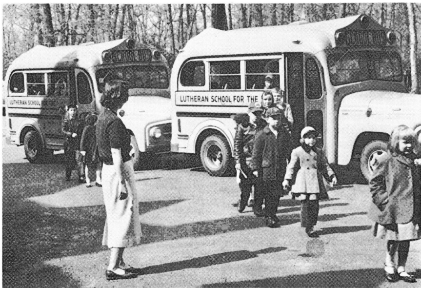
Three busses bring and return the children daily