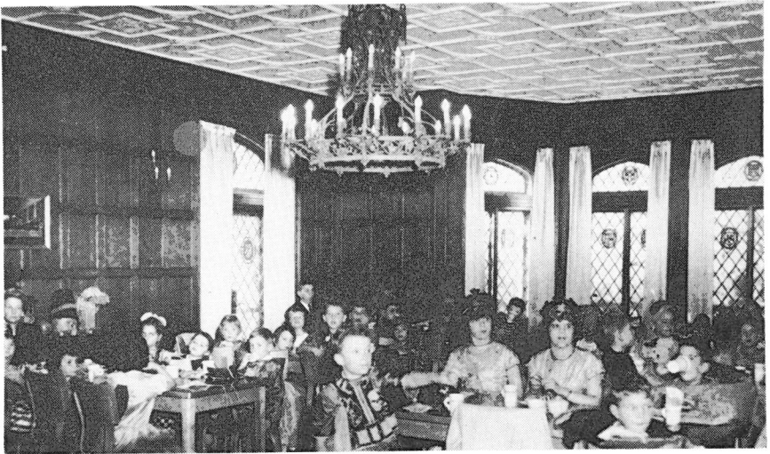
A Halloween Party in the Beautiful Dining Hall of Mill Neck Manor

Some distance from the Manor lies a connected group of buildings, the "Farm Group." These buildings lent themselves very well to the conversion into modern classrooms. Here also is a large room that can serve as playroom and gymnasium and for meetings, and there are rooms equipped with modern machinery and equipment for manual training for the boys and the teaching of home skills for the girls.