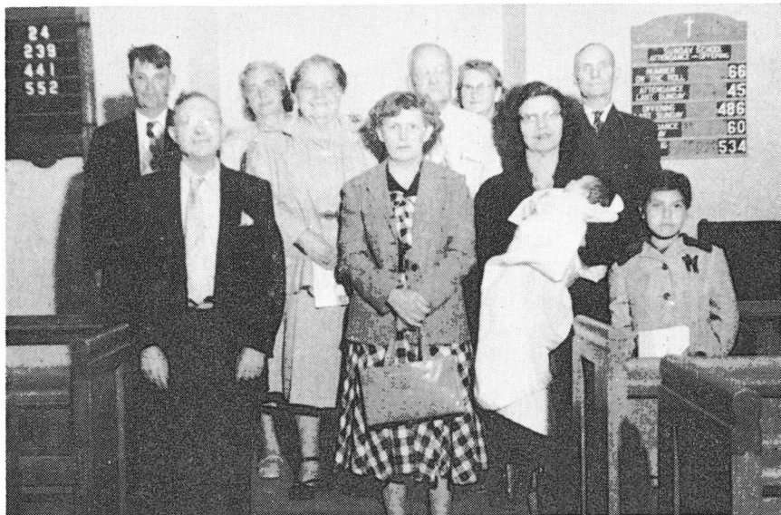
Deaf Group at St. Paul's Lutheran Church, Durango, Colo.