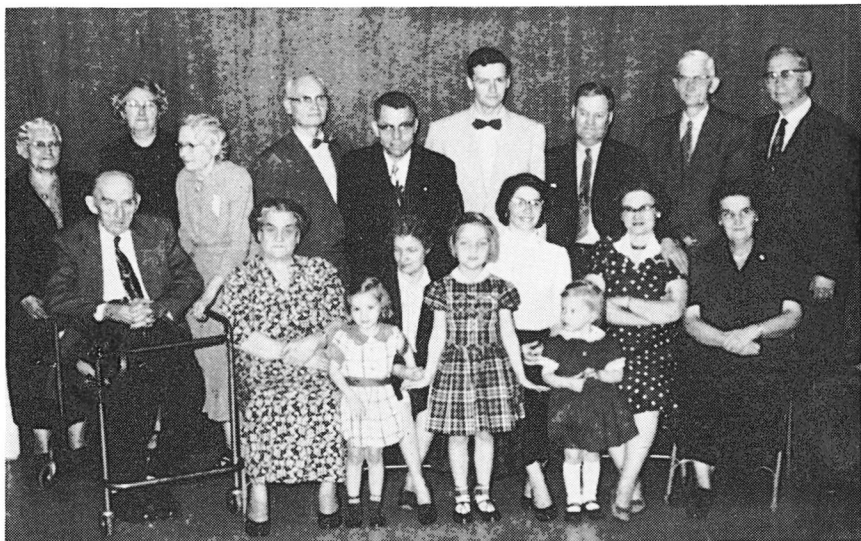
Group of Jacksonville, Ill., Deaf