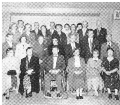
Deaf Group of Vancouver, B. C.

Vancouver, B. C. — We are presenting the picture of the group of Deaf of Vancouver, B. C., herewith. The flock is very attentive to the