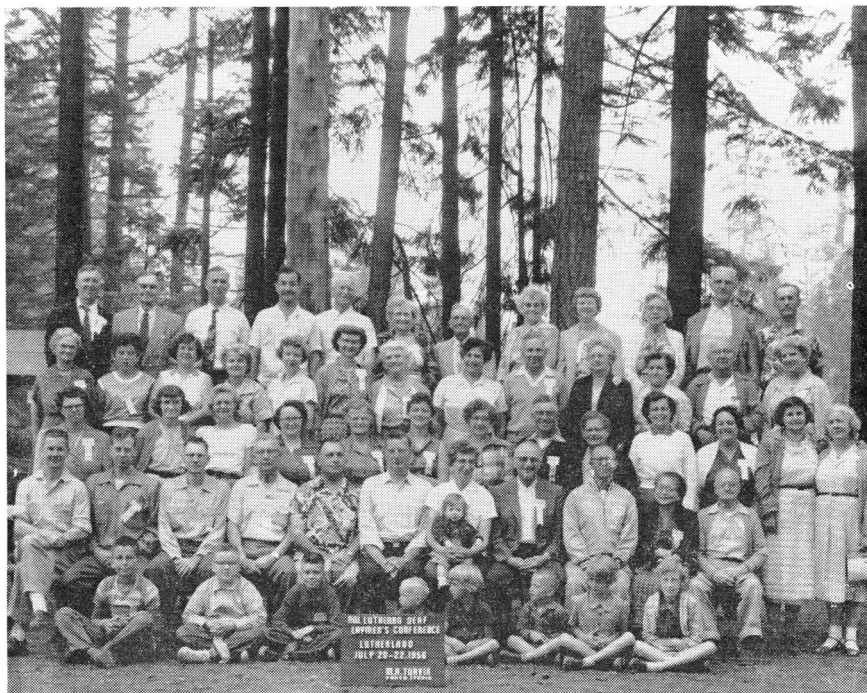
Northwest Lutheran Deaf Laymen's Conference