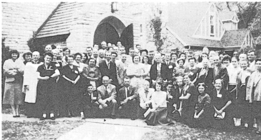
Midwest Conference of Lutheran Deaf Lay Members and Pastors (Story in January number, p. 6)