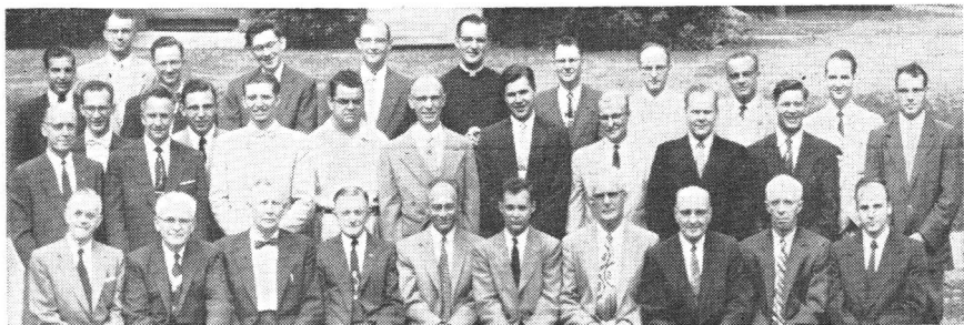
Ephphatha Conference, St. Paul, July 1—5, 1955