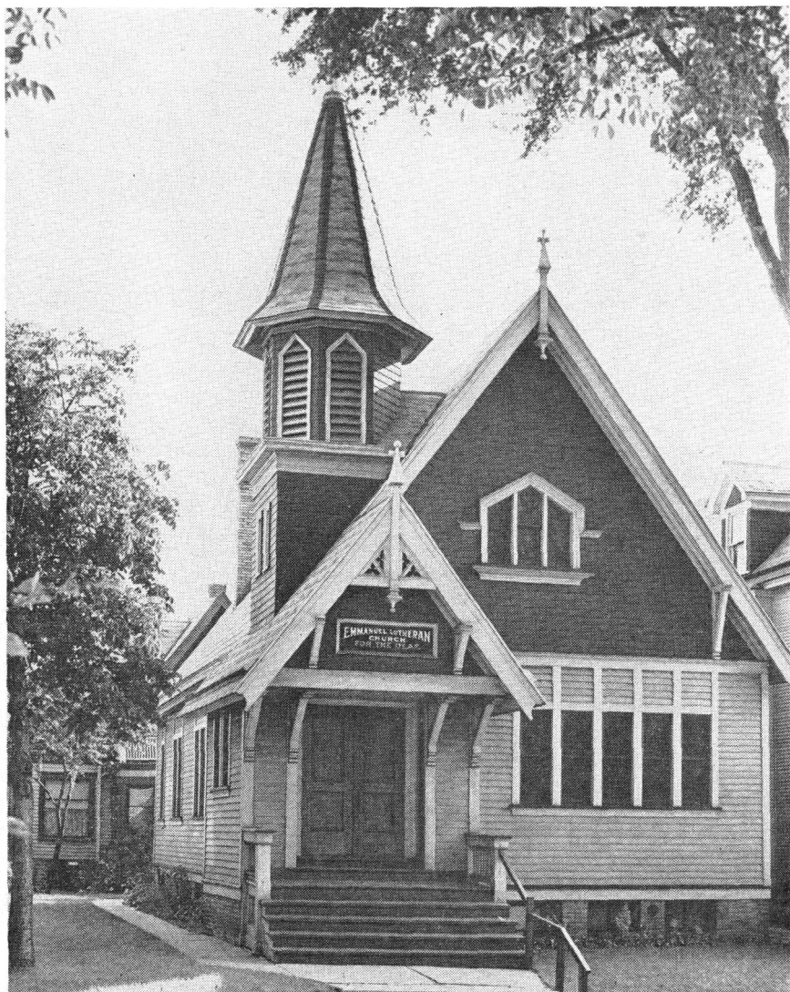
First Chapel and Parsonage (rear) of Emmanuel Lutheran Church of the Deaf, Milwaukee. First Lutheran Chapel of Deaf in United States

14, 1901, was the first Lutheran church for the Deaf in the United States. It has been sold to a Baptist group of colored hearing people who will use it for church purposes. A farewell service was held by Emmanuel Congregation on June 26. With feelings of deep gratitude to God for the many blessings received