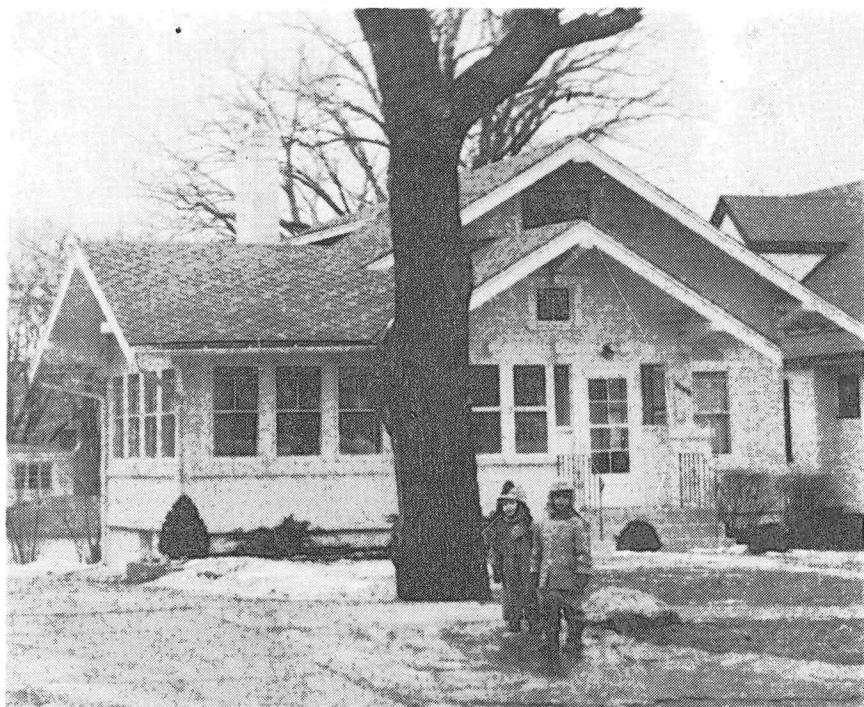
Parsonage of Calvary Lutheran Church, Des Moines, Iowa