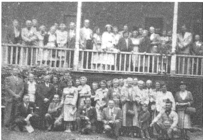
Northwest Lutheran Deaf Lay Conference, Spokane, August 13—15

Saturday morning the meeting was held in the rustic outdoor "Sunset Chapel." After devotional serv-