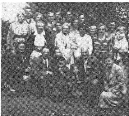
The Portland Group at Liberty Lake