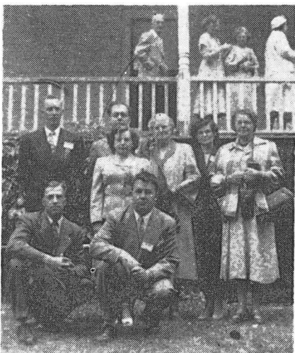
Montana Group at the Northwest Lutheran Laymen's Conference at Seattle, August 13-15