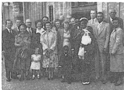
Deaf Lutheran Congregation, Denver. Services held in the chapel of the Lutheran Servicemen's Center