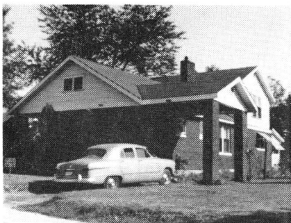
New Grace Lutheran parsonage, Memphis, Tenn.