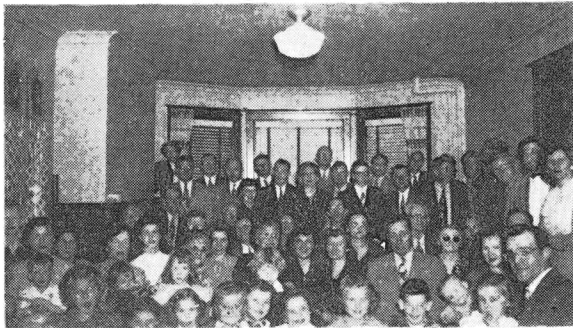
Christmas Party at Parish House Silent Lutheran Church, Madison, Wis.