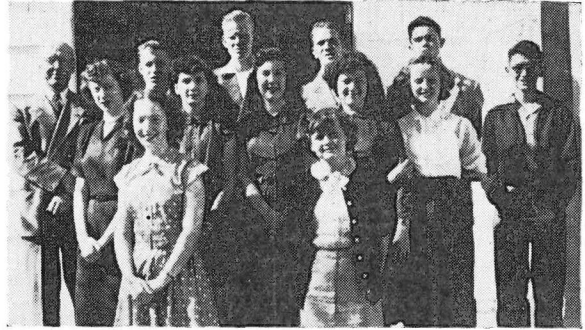
Olathe, Kansas, Class

It was a privilege in the last few weeks to administer Holy Baptism to seven scholars of the School for the Kansas Deaf at Olathe. The picture shows these friends and also four additional persons who made a confession of their faith on May 10, 1953, a total of eleven being confirmed. At our other school in Colorado Springs two were received. Holy Baptism was administered to two friends, and five received