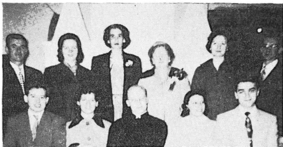
Rochester, N. Y., Confirmation, Palm Sunday, 1953

On May 16 a Military Whist card party was held in the basement of St. Matthew's. A very capable teacher, Deaf, came from faraway Philadelphia to teach the game. The 90-odd Deaf that came had a most enjoyable time milling around from table to table finding partners and what not. Glad to see the fun and