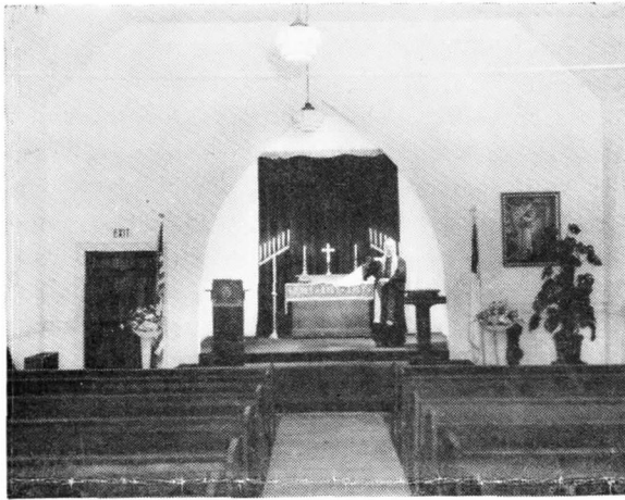
Can you tell us about this picture?