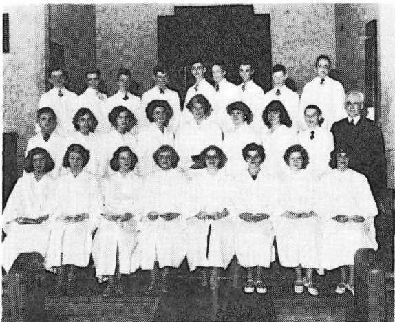
Omaha and Council Bluffs Schools Confirmation Class