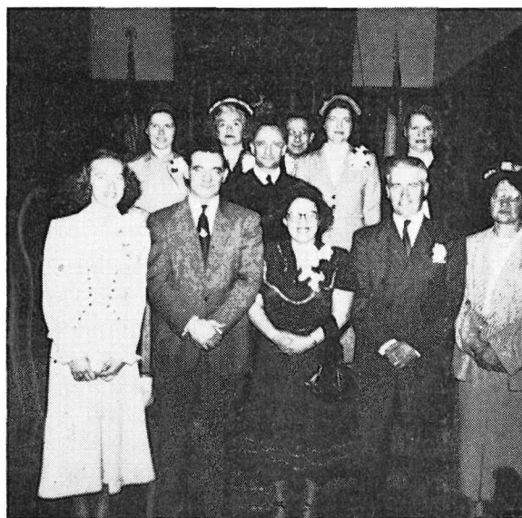
New Members Received into the Detroit Congregation on Easter Sunday