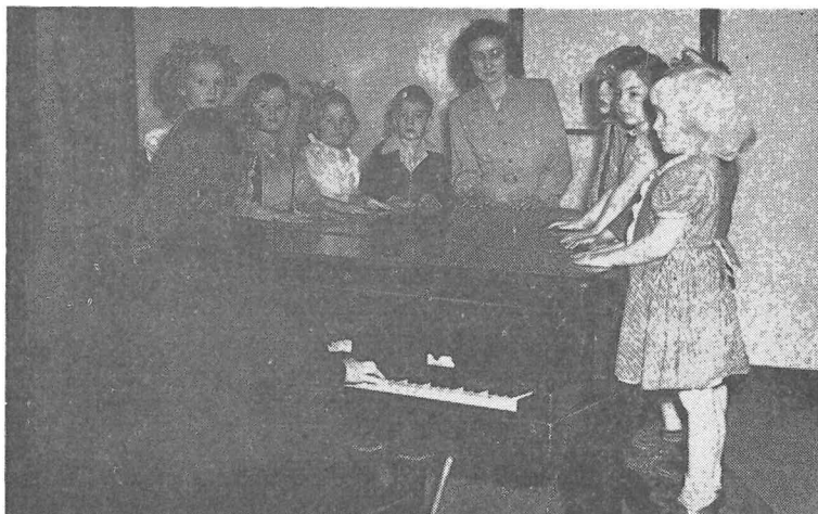
The piano is used to develop rhythm and speech in young deaf children (Detroit)