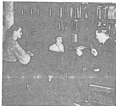
Testing the Hearing with an Audiometer

Mary, the mother of John Mark, lived in Jerusalem. She believed in Jesus. It was now dangerous to believe in Jesus. King Herod