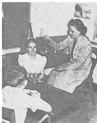
Training the Residual Hearing of a Deaf Child