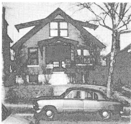
St. Louis Parsonage and New Auto

Under Item 2. $60 additional will be raised from Field offerings (out of town) to total $240, our District quota. Cash on hand, January 1, 1951, was: General Fund, $82, Lot Fund, $1,779.