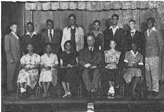
Class Baptized and Confirmed Sunday, March 26, 1950, Tennessee School for the Deaf, Knoxville, Tenn.

Knoxville, Tenn.—This class has been faithful in attendance at the service in school and at every session of the class for instruction. During all the years I have gone there, the attendance has always been 100 per cent. I feel this is a real record. The interest and attention never varied. Another thing which has been a keen joy