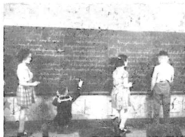
First Grade Children doing written language