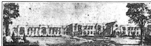
Lutheran School for the Deaf, Detroit, Mich.