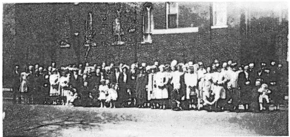
Our Savior Lutheran Church and Congregation Members at Chicago, Ill.

We feel certain that with the co-operation