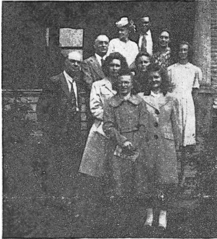
A group of Lutheran deaf in Northern Michigan whom we serve together with similar groups in neighboring cities. Among them are four deaf-blind

Under God's blessing we are looking forward to another year of success in our school work at both the