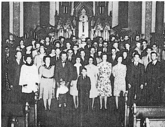
Cleveland Deaf After a Service

Though handicapped in many ways, he has never missed one of our services in that city