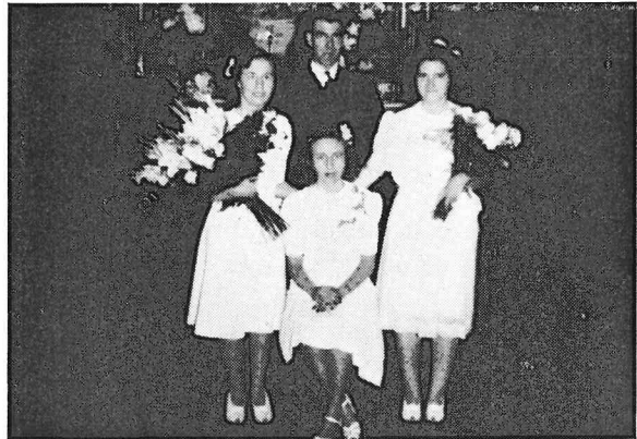
Confirmation Class, New York City

Through the interest and zeal of our members another large class has been organized to study for confirmation. I am sure it is very pleasing to God when the members of His Church here on earth show such love for the souls of their fellow men. When we are concerned about the souls of others, it shows that the faith which we confess means very much to us. Certainly God has richly blessed our efforts in the interest of His Church. May God continue to bless us, so that