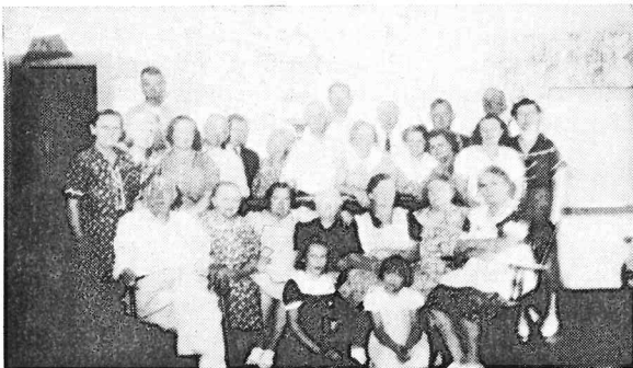
Residents of the Indiana Home for the Deaf at Brookston

Missions for Blind and Deaf. —We continue to receive many interesting letters from the readers of the DEAF LUTHERAN and our periodicals for the blind.