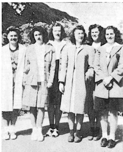
Golden Gate Mission

Golden Gate Mission. — Once again the California State School for the Deaf prepares for commencement exercises. When this graduating class leaves, we part with some of our finest church workers, who for years have done much to interest others in the knowledge of the Savior. These girls have been with us a long time and take with them a fine understanding of the Holy Scriptures. They will be witnesses wherever they go.