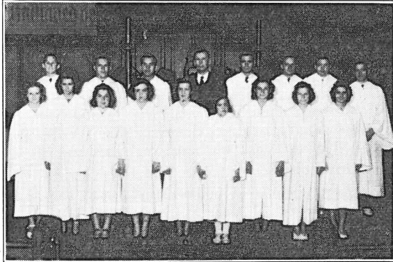
Confirmation Class at Jacksonville, Ill.

Our congregation plans soon to complete the alterations and equipment of our chapel property. The St. Louis Lutheran churches have been very kind in helping us get the funds that will give us the classroom equipment for the instruction of deaf children orally and the much-needed recreation room, which is obtained