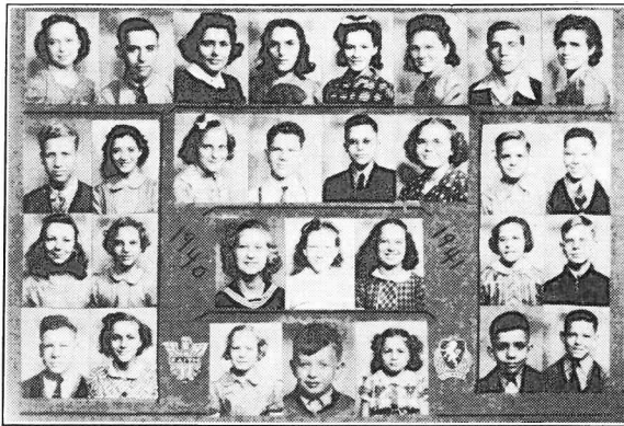
Evangelical Lutheran Sunday-School State School for the Deaf, Columbus, Ohio